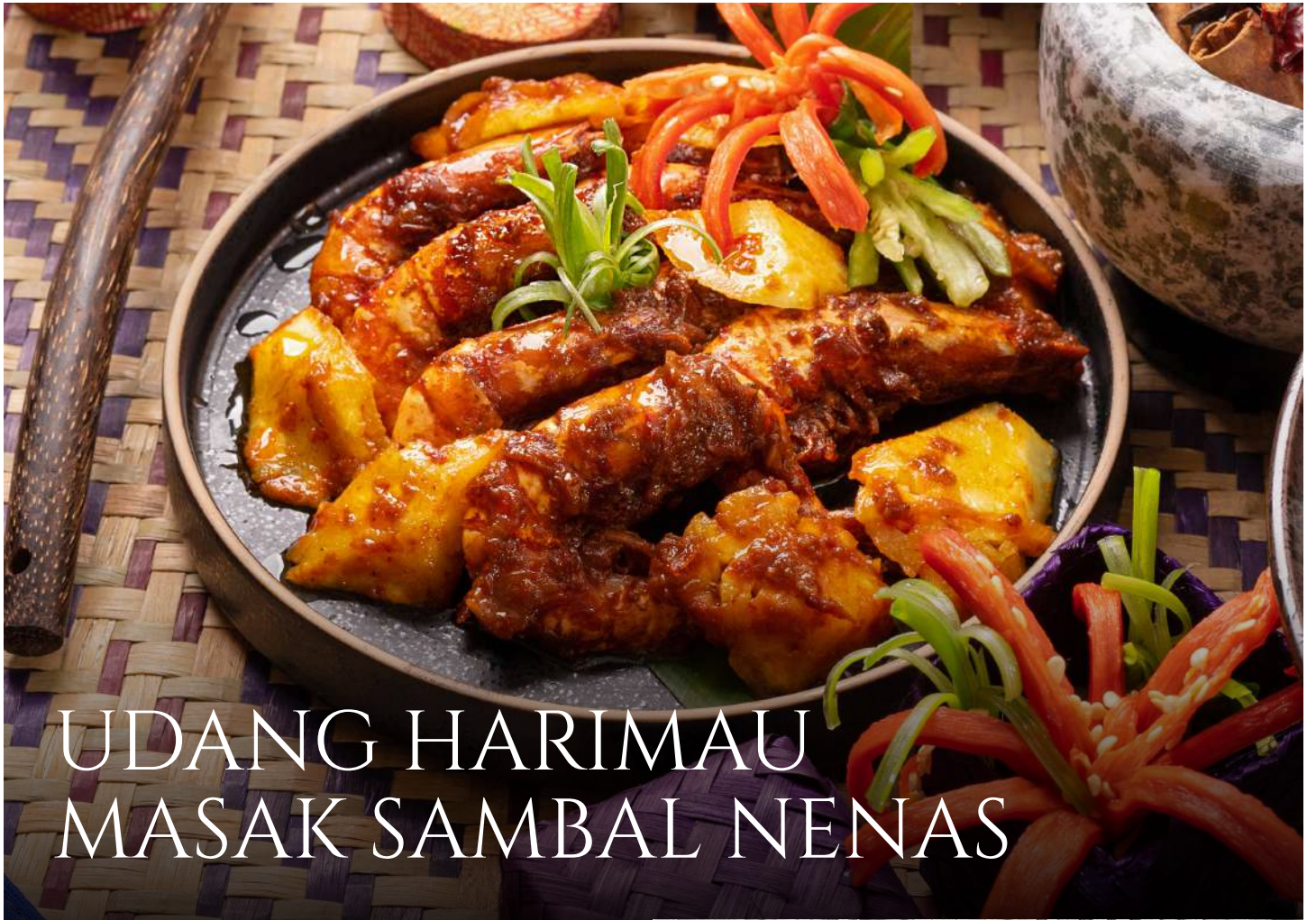
UDANG HARIMAU MASAK SAMBAL NENAS